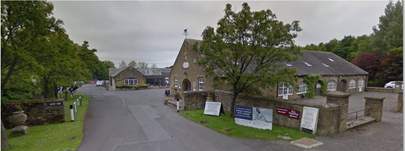
Photo 3: The Milkhope Centre, one of a number of 'rural business centres' in the Parish

There are a number of rural 'business centres' within the Plan area. These are specifically defined in Policy 5 and are identified on the Policies Map. These business centres are not only important for the local economy, but also provide a service to local residents, providing facilities that reduce the need to travel, and promote local shopping and use of local services.