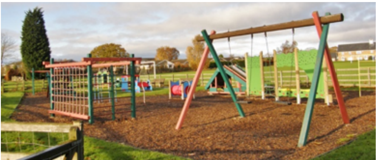
Photo 2: Stannington Playing Fields and play area - designated as Local Green Space

There is an opportunity for Neighbourhood Plans to designate Local Green Spaces under the provisions of paragraph 77 of NPPF. The intention of the Neighbourhood Plan is to afford greater protection to this site as a valued community space through this designation as Local Green Space. The policy restricts new development on the designated Local Green Space, except where it is required to enhance the community and/or recreational value of that space.