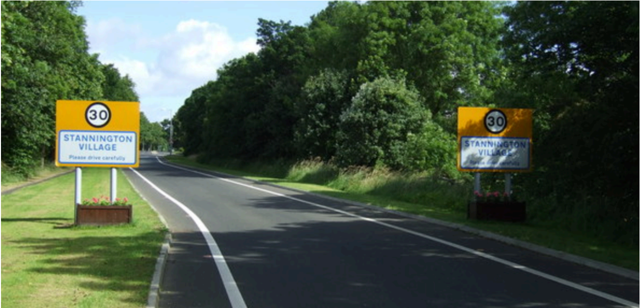
Photo 4: Entrance to Stannington Village - traffic speed is key issue in Stannington and Stannington Station

Objective 4: 'Reduce the detrimental effect that road traffic has on residents and businesses in the Plan area, whilst seeking improvements to local highway networks, including pedestrian and cycle routes, and public transport provision'.