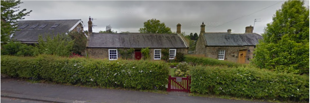
Photo 5: Part of the proposed Conservation Area in Stannington Village

Stannington Station has a different character to Stannington village. It is a dispersed, rural settlement, with open views across to the countryside. It will be important to maintain these open views to retain the agricultural feel of the settlement, something which was considered to be highly important to people living in that area. This rural context will be an important factor to consider in the design of any future development proposals. Stannington Station is in the Green Belt.