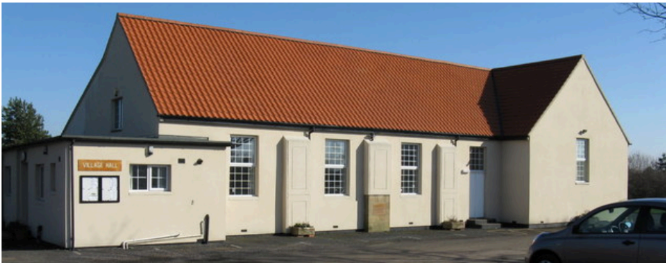
Photo 1: Stannington Village Hall - a much valued Community Facility

A community action is proposed to list Assets of Community Value (ACVs) under the 'Right to Bid' legislation contained in the Localism Act 2011. It is expected that the ACVs proposed by the Parish Council will be registered where they meet the criteria set out in the relevant Regulations. A list of all community actions is contained in Part 6 of the Plan. As part of this community action, the Parish Council propose to undertake further consultation to establish which community assets to propose as Assets of Community Value. Once this consultation has been conducted, and Community Assets have been registered, then Policy 1 will be applied to any proposals involving the loss of a registered ACV.